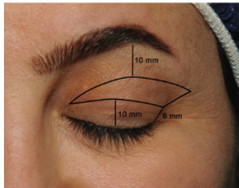
Figure 1. Pre-operative markings.

was performed. In group (B) horizontal subcuticular suturing was performed. After the closure of the skin, skin-tape is used for dressing. Stitch removal was done on the 5 th post-operative day. The patients were seen again at 1 month and 6 months. At the 6 th month post-operative period, POSAS was used to assess the outcome of the surgery, the patients were not informed about the type of suturing and the observer was also not aware of the type of suture used, Figure 2.