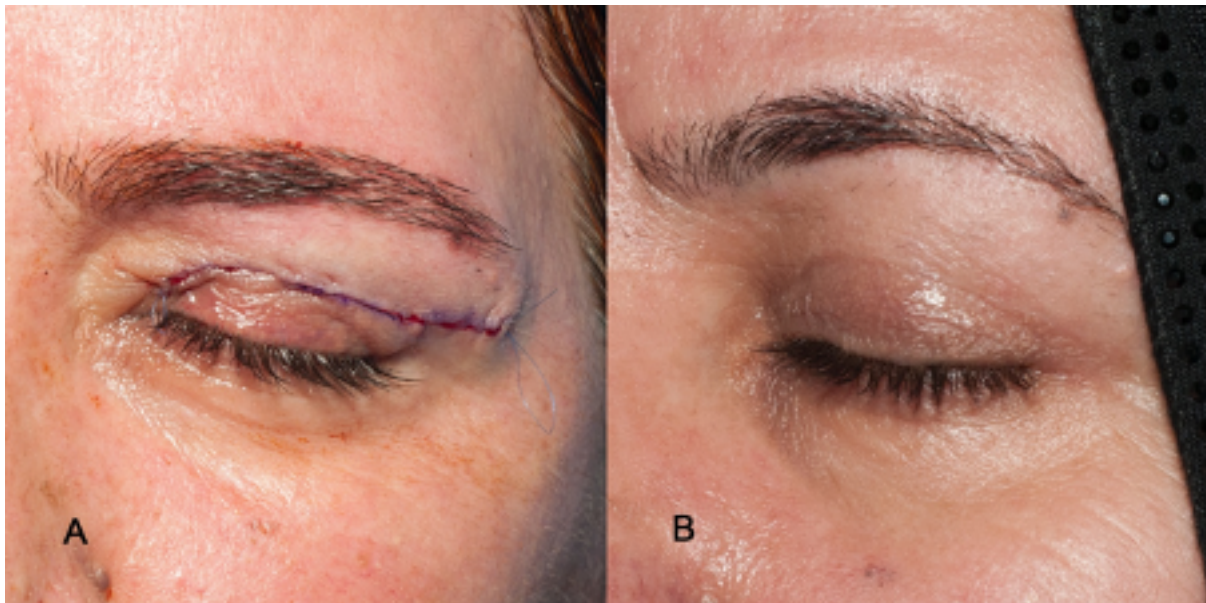
Figure 4. Subcuticular suturing. A: Intra-Op. B: 6 Months Post-Op.